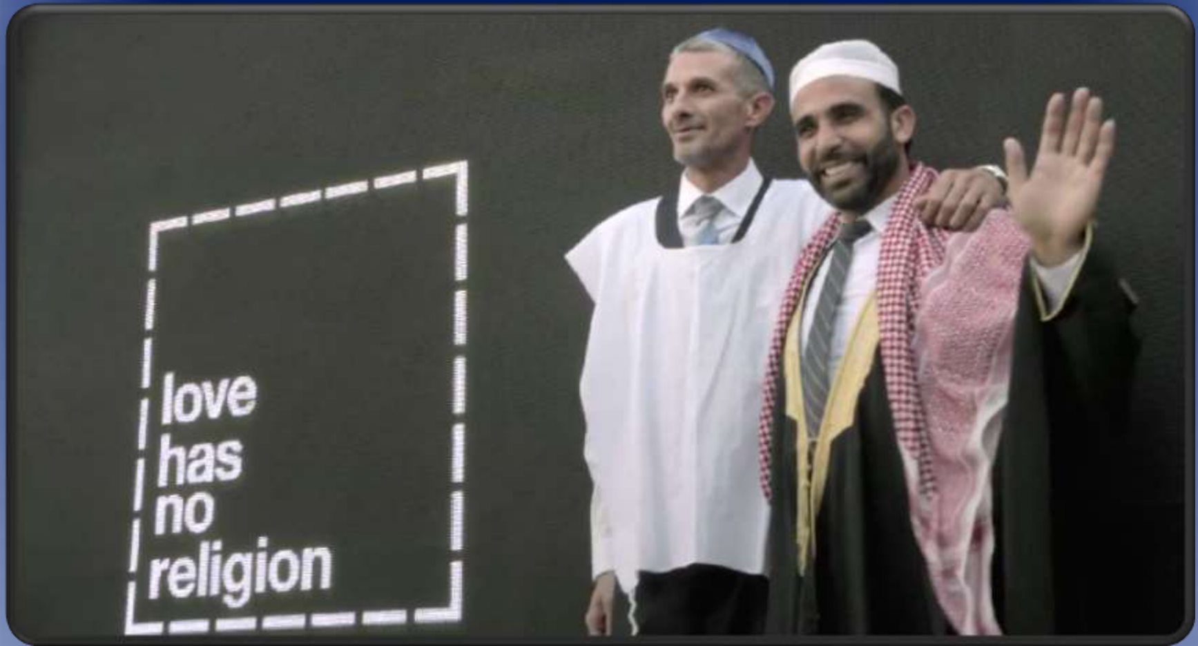
"Love has no labels" Campaign by The Ad Council